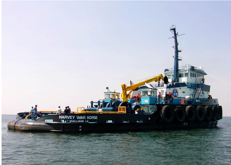
“WARHORSE” 10,000 horsepower Ocean Tug 2002