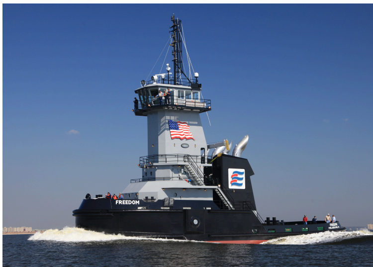
“FREEDOM” 6,000 horsepower Ocean Tug 2010