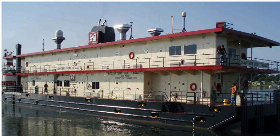
“TAGGATZ” 160' Quarters Barge 2008